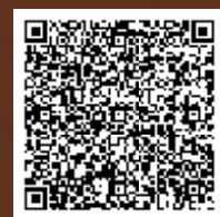
MahaRERA QR Code