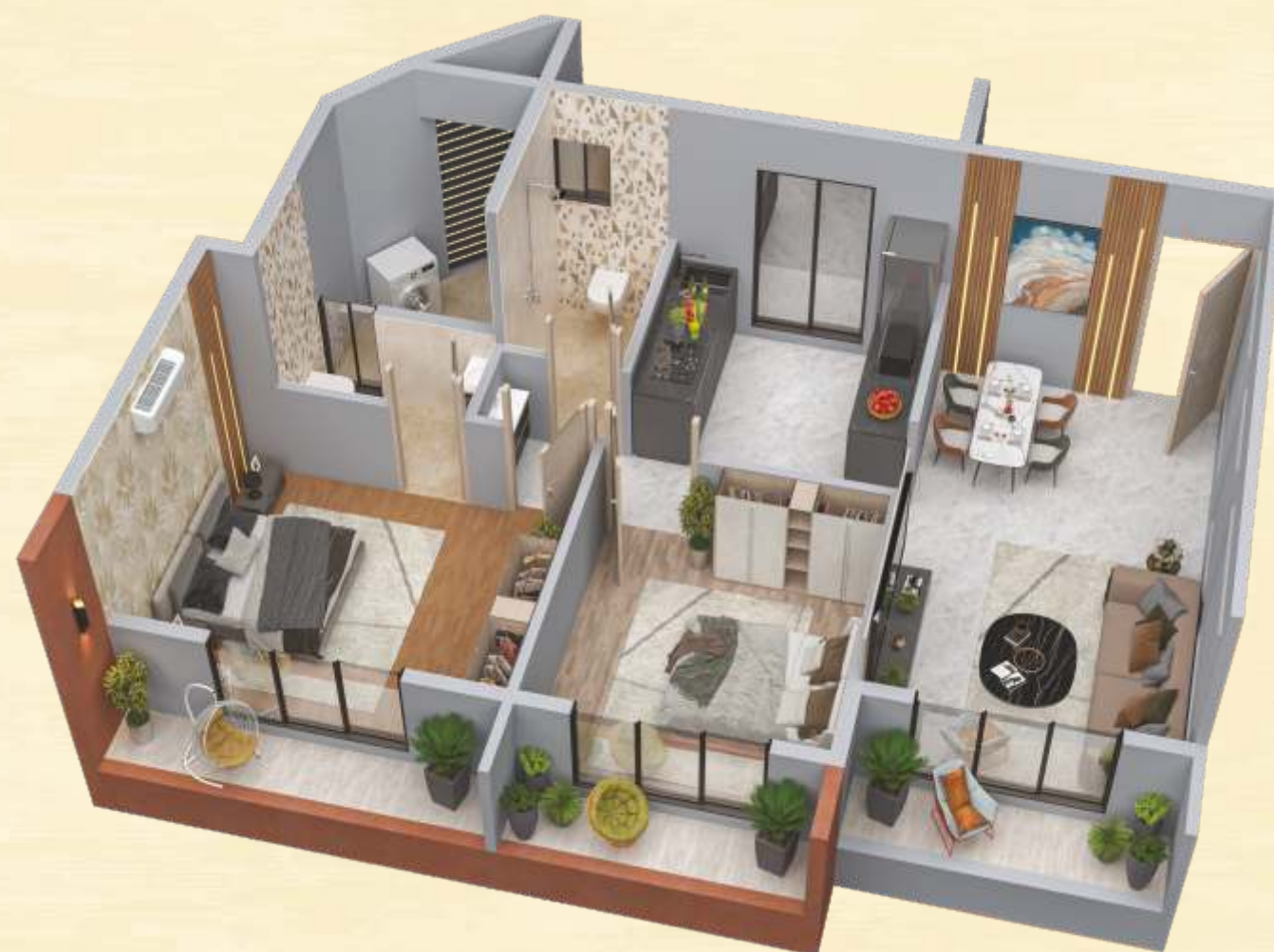
2 BHK WITH BALCONY