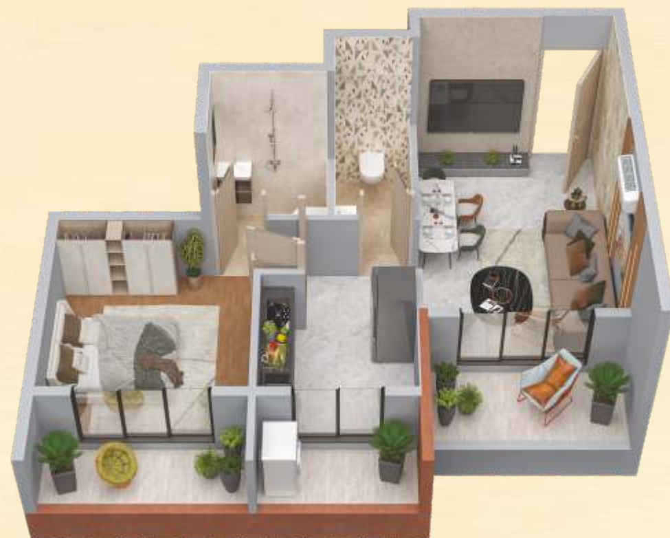
1 BHK WITH MASTER BEDROOM