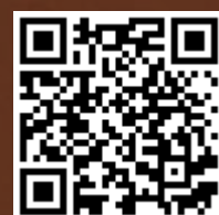
LOCATION QR Code